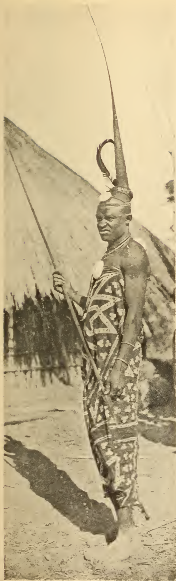
A STRIKING HEADDRESS

A Mashukalumpe man. Near the Kafukwe River, upper N.W. Rhodesia.